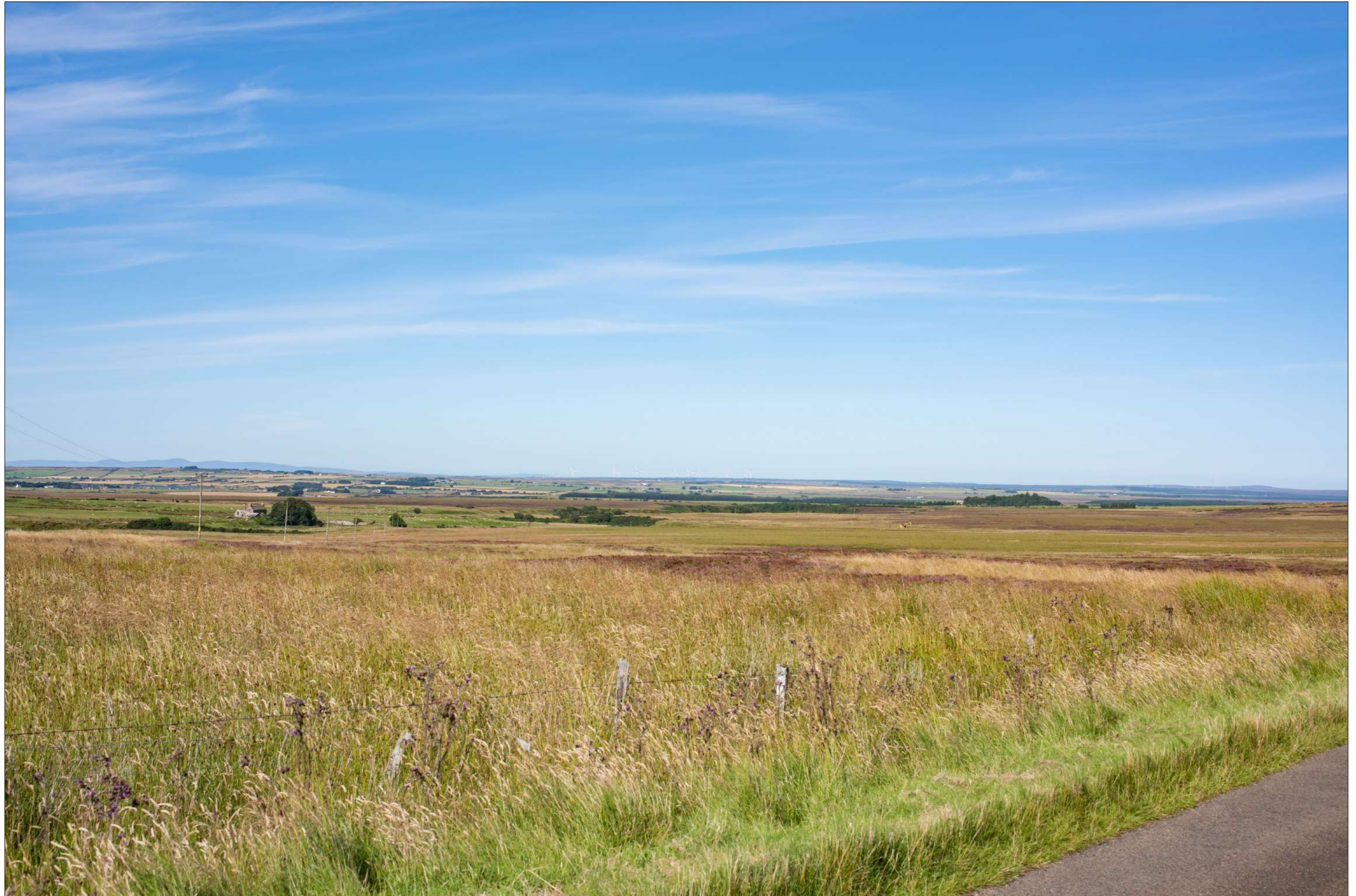
Figure: 7.33-THC-03 Viewpoint 20: Badlipster

When viewed at a comfortable arm's length (approx. 500 mm), this printed image is representative of our detailed central vision, but is not representative of scale and distance.