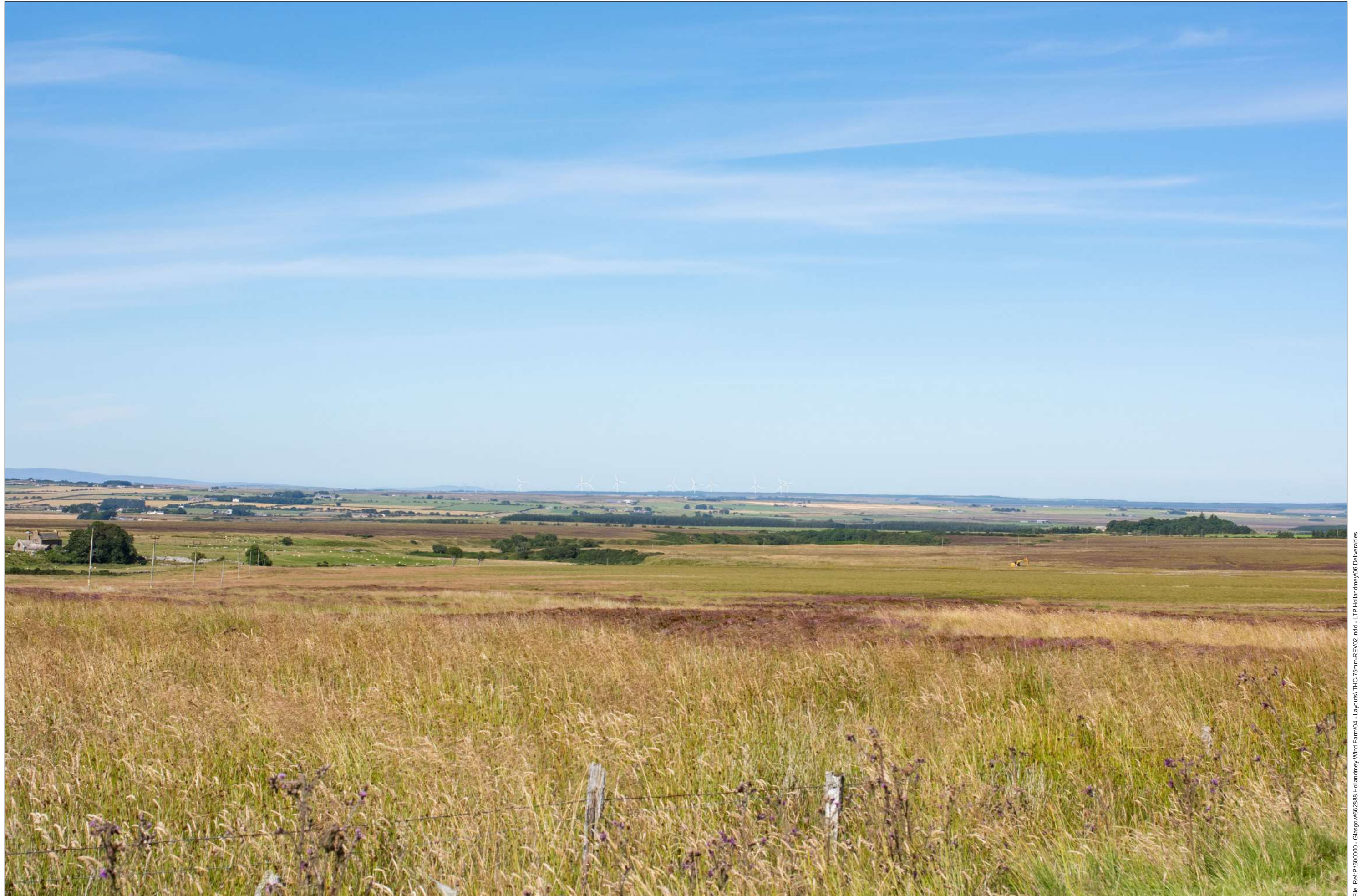
Figure: 7.33-THC-04 Viewpoint 20: Badlipster

This image should be viewed at a comfortable arm's length (Approx. 500 mm)